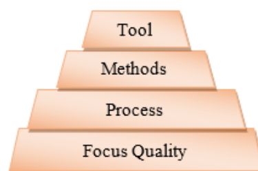
Figure 1. Software engineering layers

To be able to understand SE, one needs to view and comprehend that it is a layered technology where each layer seeks the fulfillment of its predecessor show in Figure 1.