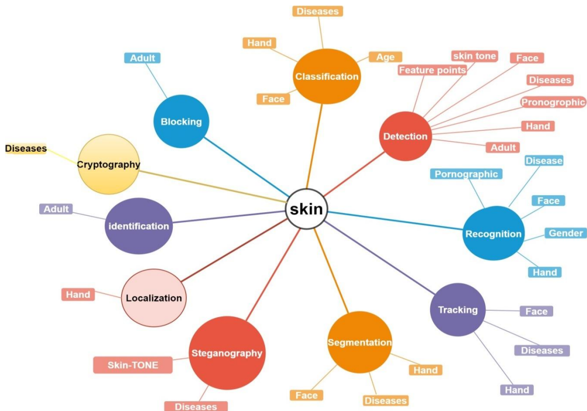
Figure 1. Types of human skin applications

The detection of the skin plays an important role in a wide range of image processing applications, from facial recognition to face tracking and various digital communication domains. There are ten types of human skin applications, which are detection, classification, blocking, cryptography, identification, localization, steganography, segmentation, tracking and recognition, as shown in Figure 1. For the next section, we explain each application and its correlated datasets.